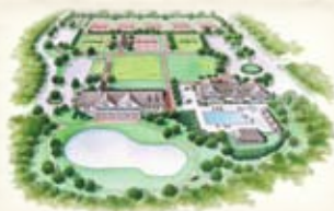
Field Club Gains Zoning Approval ~ page 2

A S WE ENTER the first days of spring, we can look back at a productive winter that saw some very significant developments for the Club. The most important of these is that we received the final approval for the Field Club in Katama from the Edgartown Zoning Board of Appeals at their February 21st meeting. This is a considerable milestone for the project and we are truly thankful to all who offered their support throughout the permitting process. We were very encouraged to receive unanimous decisions and votes of approval by all of the town boards and eagerly anticipate beginning construction.