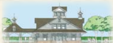
The Boathouse Design Team ~ page 3