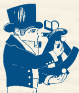
The History of the Navigator Restaurant ~ page 4