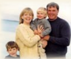
Meet a New Member ~ page 4

We wanted to recognize and offer our gratitude to our Founding Members. From the Club's inception, nearly two year ago, their confidence, support and encouragement were instrumental in moving the project forward. We would also like to welcome the families who have already been accepted for membership. This summer we are planning a series of events that will offer the opportunity to get together and renew old friendships and meet new members of the Club. We look forward to seeing all of you at these events and sharing ideas on the future operations of our facilities.