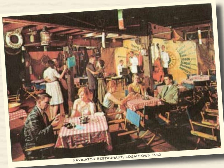
NAVIGATOR RESTAURANT, EDGARTOWN 1960